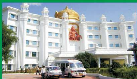
MOU with Gleneagles Aware HOspi Hospital

Modern Infrastructure Facilities Experienced & Dedicated Faculty Excellent Placement Track Record Results with University Ranks Advanced Teaching Methodology Industrial Exposure Canteen & Gymnasium Sophisticated Labs Students Activity Centre CRT & Communication Classes Good Transport Facility Research Centre Hostel & Mess Facility Seminars & Symposia