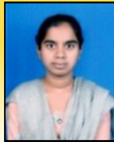
A. HAVYA VAHINI 21GNIR0002 AGS HEALTH